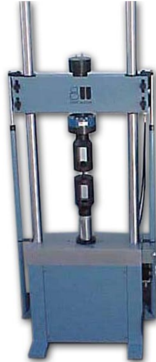
Model 302 Load Frame

No intermediate threaded joints or compression joints are utilized and the load is transmitted directly into the crosshead during testing.