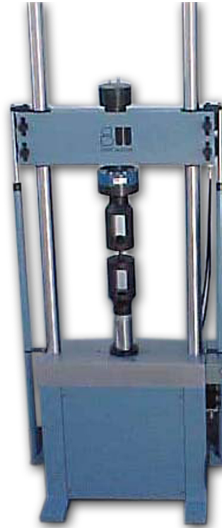
Model 302 Load Frame

No intermediate threaded joints or compression joints are utilized and the load is transmitted directly into the crosshead during testing.